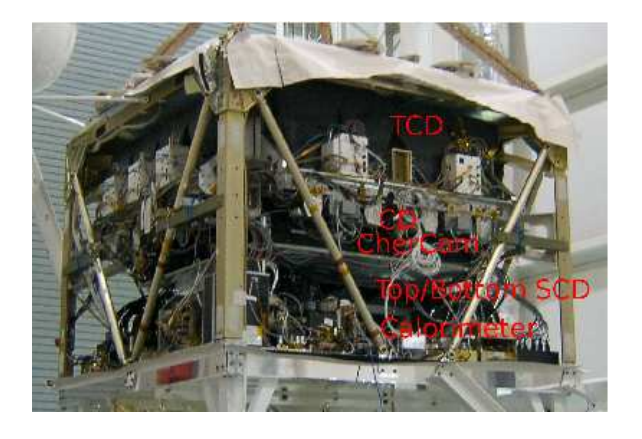
Figure 1: CREAM-III Instrument; From the top: TCD, CD, CherCam, top and bottom SCD, and Calorimeter.

The CREAM-III payload was launched from Williams field near McMurdo station, Antarctica on December 19, 2007 and the payload landed on January 17, 2008 after \sim 29 days of flight. Throughout the CREAM-III flight, detectors performed stably. For the calorimeter, no in-flight adjustments were needed for values such as the high voltage for the hybrid-photo-diodes or trigger threshold, while those were adjusted in the previous two flights to optimize data rates. The live-time fraction during data collection was about 99%. The reduced noise level in the calorimeter electronics allowed the trigger thresholds to be lowered to about 15 MeV, whereas it has been about 50 MeV for the two previous flights. In addition, the sparsification threshold value